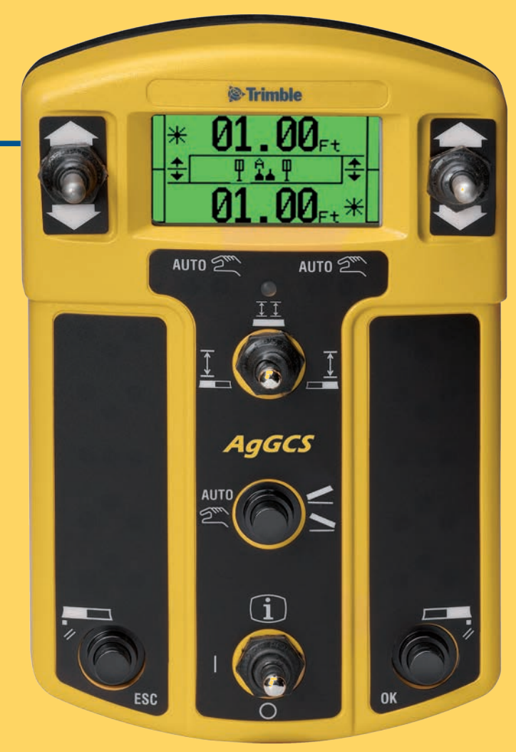
CB415 control box