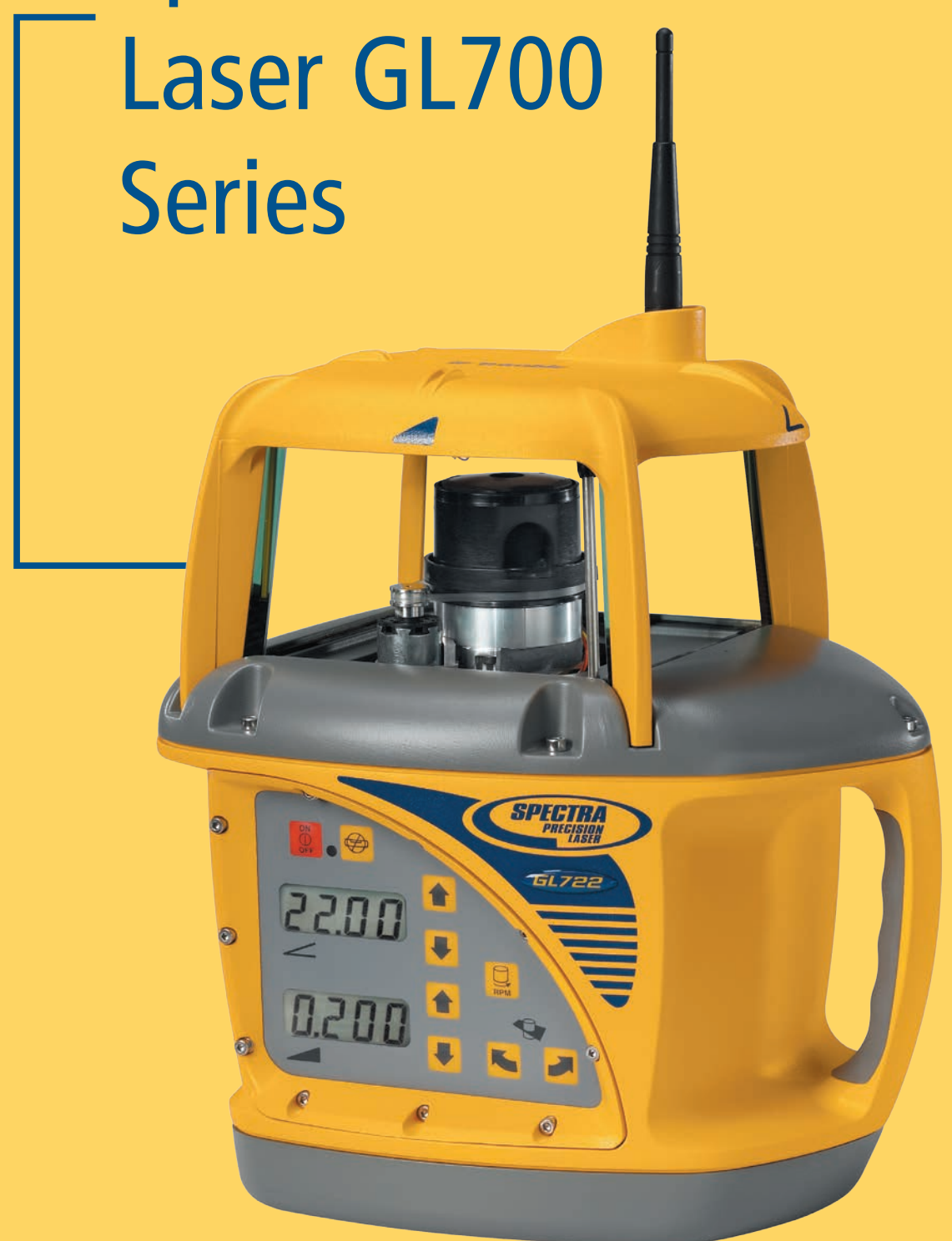
Spectra Precision Laser GL700 Series